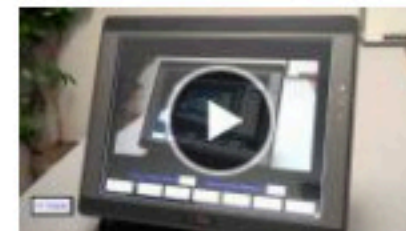
Video Input (HMI5121P and HMI5150P Models) -- Maple Systems Touchscreen HMI