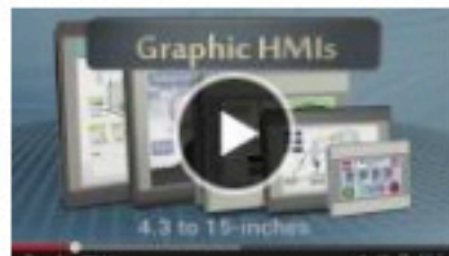
Graphic HMIs Maple Systems YouTube