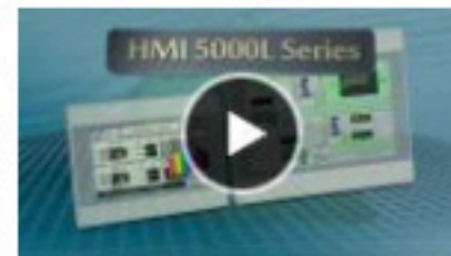
Maple Systems Graphic HMI 5000L Series